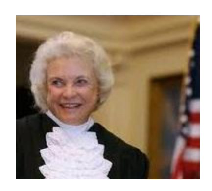
Sandra Day O'Connor